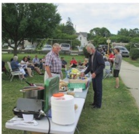
• FCC Men's Softball Tailgate

—AD1D698C-A486-4A09-82A6-64C07C463E3F.jpg—