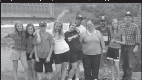
Members of the ASP Mission Team and one of the families they helped on their trip to Appalachia.