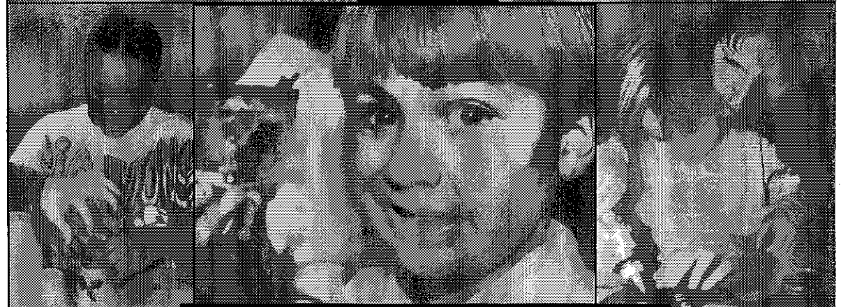
Top: Friendly Beasts, Middle: Christmas Workshop, Bottom: Pageant