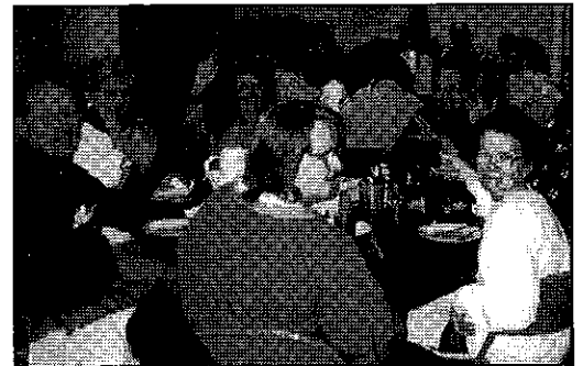
Adult Retreat Group