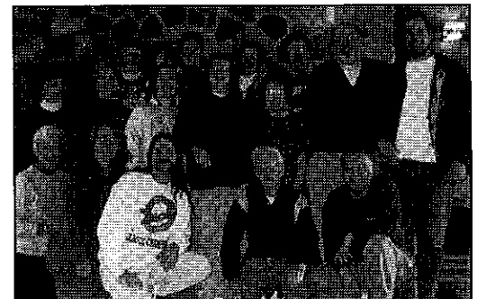
Adult Retreat Group