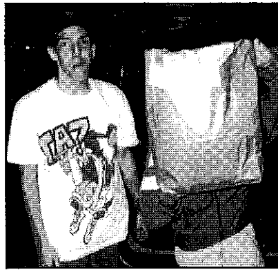
PF'ers bring supplies to Salvation Army