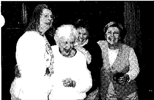
Adult Retreat Group